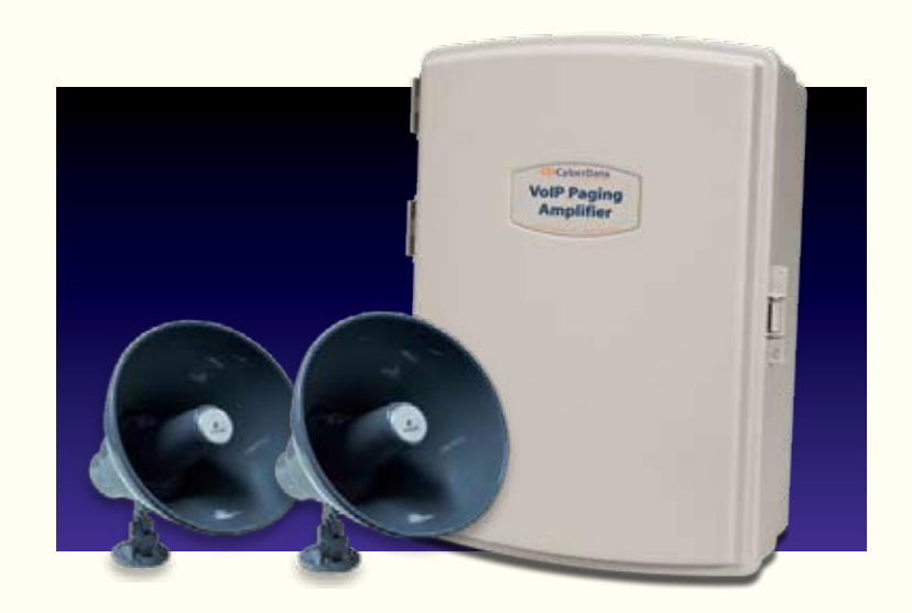
VolP Phone Peripherals